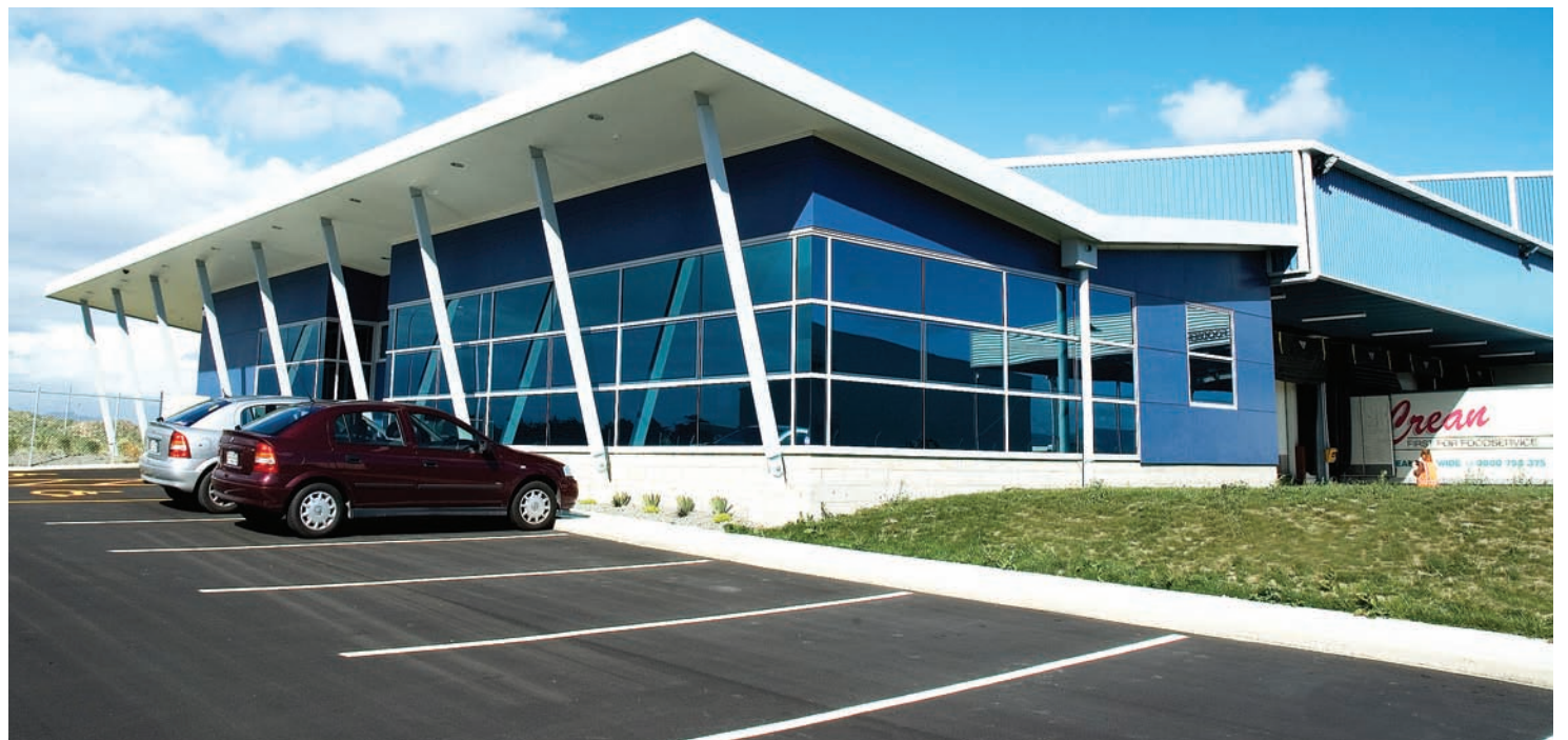
Much of Peter Swan Limited's work is in small towns and cities throughout New Zealand, including the Bidvest NZ site in Palmerston North

"As specialist food industry designers, that rubs off on us a little. Hopefully we add to that reputation, but we also benefit from that reputation, so that when we go offshore, being from the New Zealand food industry means we get a hearing that possibly wouldn't happen in other fields."