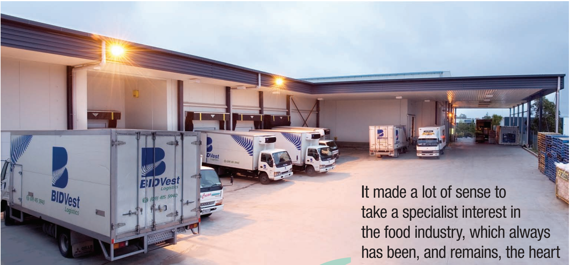
Bidvest NZ Ltd in Albany has recently been expanded